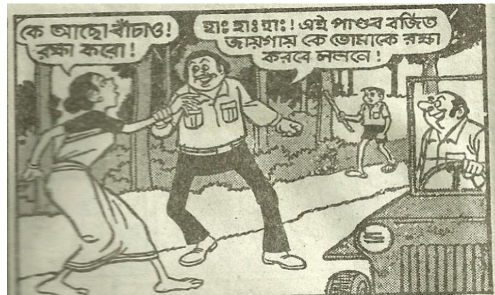
Figure: 1: A Panel from Nonte Fonte collection 7, 8, 9.