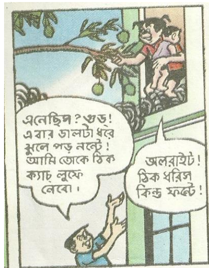
Figure: 10: A Panel from Best of Nonte Fonte. Page 35.