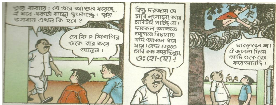
Figure: 9 : A Panel from Best of Nonte Fonte. Page 35.

An elderly person is worried because a house is on fire and a baby is left inside. He seeks the help of Nonte and Fonte. Nonte rescues the baby. (The given one in the text ).