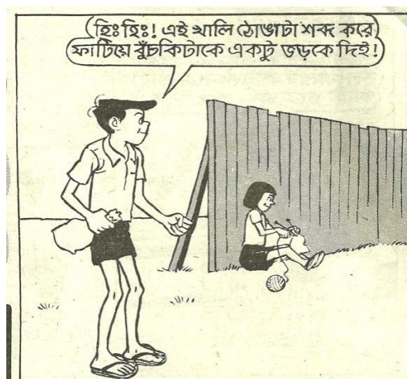
Figure:7: A Panel from Handa Bhondar Kandakarkhana(13-15).Page 19.

The ball of wool is used here as a medium to teach Handa a lesson for tormenting both Bhonda and Buchki. Buchki is the name of the girl who is shown knitting the wool when Handa interrupts her. But the noticeable thing about her presence is the incomprehensibility and ambiguity regarding her sexuality as illustrated.