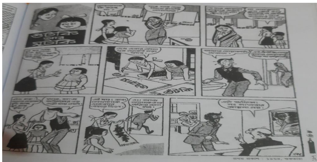
Figure 5: Shutki Mutki: Image taken from Comix and Graphix. Issue 2, 2016. Book Farm. Page 187.

This falls in place from the perspective of feminism where, ironically women themselves were not ready to accept the non-conformistic roles shown to be played by women in the comics. They rather preferred the gender stereo typed traditional roles. The inference validates the asseveration stated in this research article.