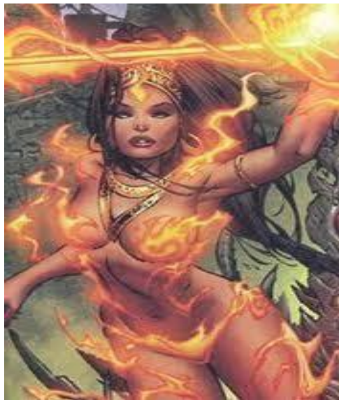
Figure: 3 Devi. A Panel from Devi, page 9

The discussion on depiction of ‘perfect’ female body through pictorial representation in comic’s genre is relevant since the reproduction and propagation of cultural values through a medium of narrative that engages Indian mythology has now taken an alternative mechanism. But it has kept intact the preconceived and premeditated poetics and politics of representation which is perhaps purposive so as to comply with the demand of the market forces. There has been a constant endeavor at amalgamation of Indian mythology and Western culture .It has generated a more recent genre of comics based on ‘superheroines’ engrossing the reader and viewer and engulfing the market. These comics are characterized by developed pattern of illustration and are stylized in an almost cinematic/ filmic pattern. The Western mode in visuals has gradually paved the way for another kind of hegemonisation – hegemonisation conforming to globalization. The mode of illustration distinctly glamorizes the ‘superheroines’. The illustrations/images having the realistic attributes and much refined graphic quality enrapture the audience. The physical femininity and the presentation thus become the prime factors in circulation of these comics rather than the ‘valour’ as .simulated. (Figures 3 and Figure 4)