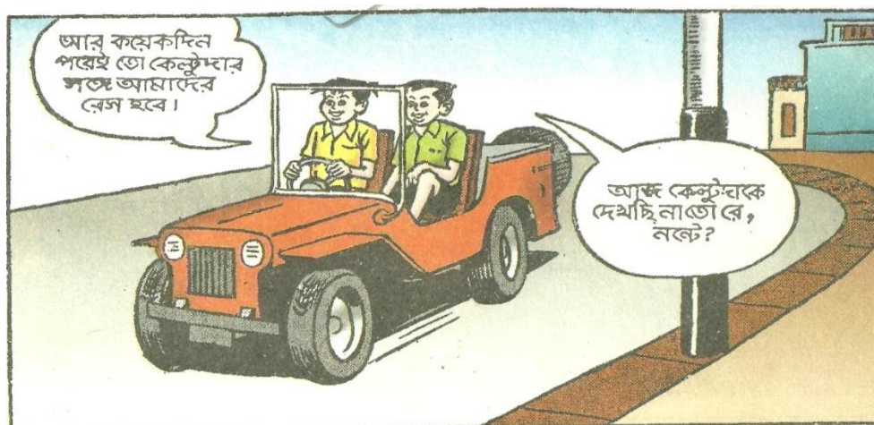
Figure: 8: A Panel from Best of Nonte Fonte. Page 47.

Nonte and Fonte sitting in a red jeep and talking about their coming jeep race competition with Keltu, the bullying senior in hostel. For the purpose of commutation test two kinds of replacement have been done. The first one is from human paradigm and the second one is from paradigm (set) of cars or means of communication. Taking into account the given context the verbal (syntax) form is—